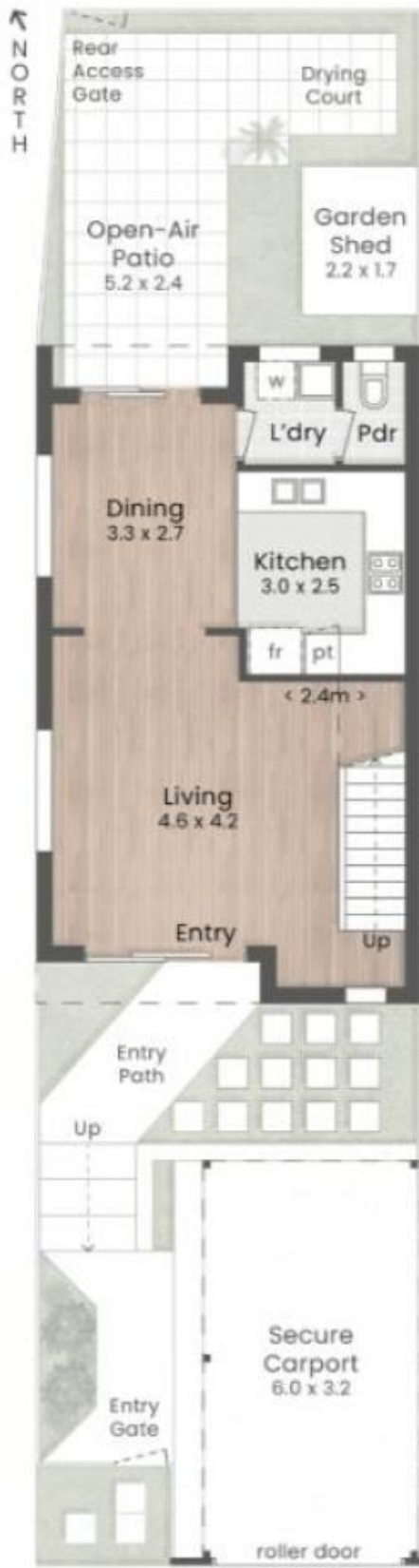
:: GROUND FLOOR